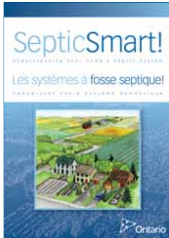
The SepticSmart! DVD and Rural Septic System Checklist has everything you need to help you manage your septic system properly.

The Rural Septic System Checklist includes practices to keep septic systems properly functioning as well as a maintenance schedule that you can customize for your own property. Attach the checklist to a basement or workroom wall for convenience and visibility.