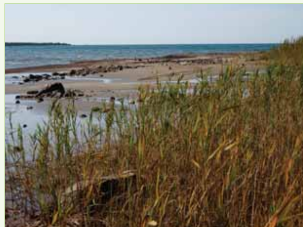
Work is underway to eliminate invasive Phragmites plants that have appeared at Singing Sands, Bruce Peninsula National Park.

If you would like to be involved in this restoration project, or are interested in volunteering with Parks Canada, contact staff at Bruce Peninsula National Park by phone at 519-596-2233 or by email at bruce-fathomfive@pc.gc.ca .