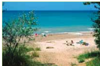
One of many summer paradises on the Lake Huron shoreline: Boiler Beach, south of Kincardine.

In addition to this newsletter, a website has been created to keep residents and communities informed, create a dialogue, and form more partnerships to support this effort. For more information, please visit www.HealthyLakeHuron.ca .