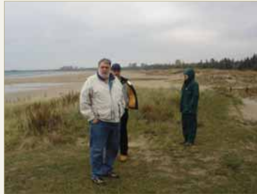
Visiting a beach restoration site at Sauble Beach.

FSB believes that our success lies in focusing on the beach and dunes, having a "can do" attitude and cooperating with the municipality.