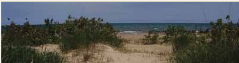
A healthy beach ecosystem.

You can help too, by continuing your efforts to undergo regular septic maintenance and limiting sediment and nutrient inputs to Lambton Shores watercourses.