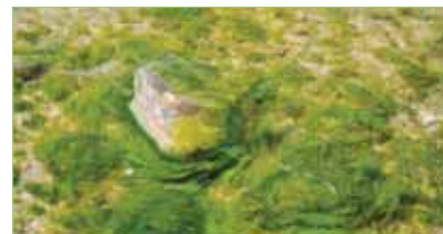
Beach fouling by algae is an unpleasant but common occurrence on Lake Huron shores. Credit: Ontario Ministry of the Environment.

Significant scientific research on the growth of nuisance algae is underway and increasing across the Great Lakes. Along the Lake Huron shoreline, the Ontario Ministry of the Environment is continuing its research through watershed and nearshore water sampling to quantify the problem and identify sources. This work will help local communities and organizations focus their on-the-ground activities on projects that will minimize the growth of nuisance algae along Lake Huron's shoreline.