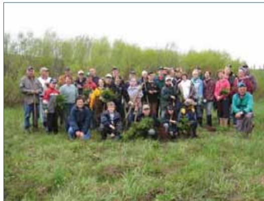
A group of keen restoration volunteers.