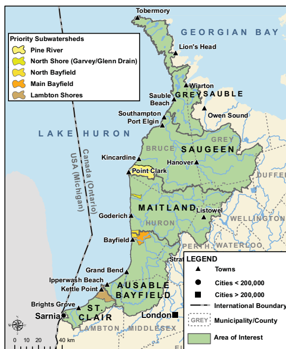
A map of the Southeast Shore Area of Interest.